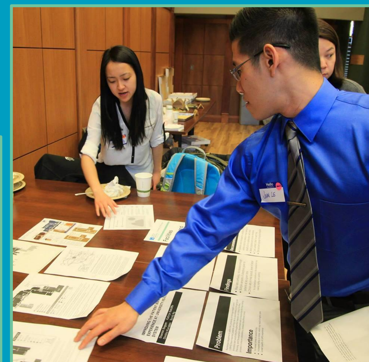
A project team member presents results to an incoming board member