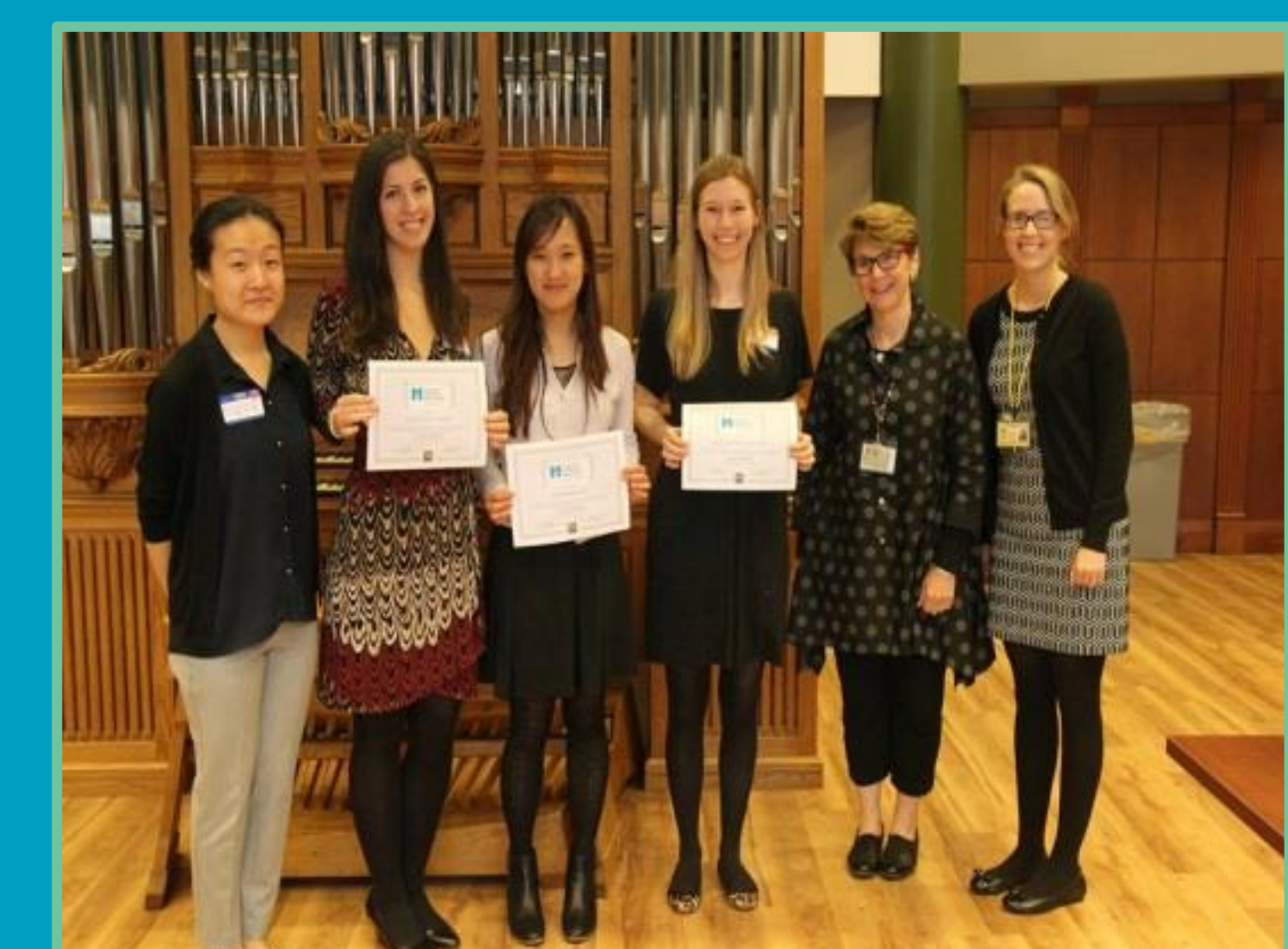
Team members and clients celebrate the completion of a year-long project

We're want to connect with new project clients, speakers, workshop facilitators, and students members and leaders!