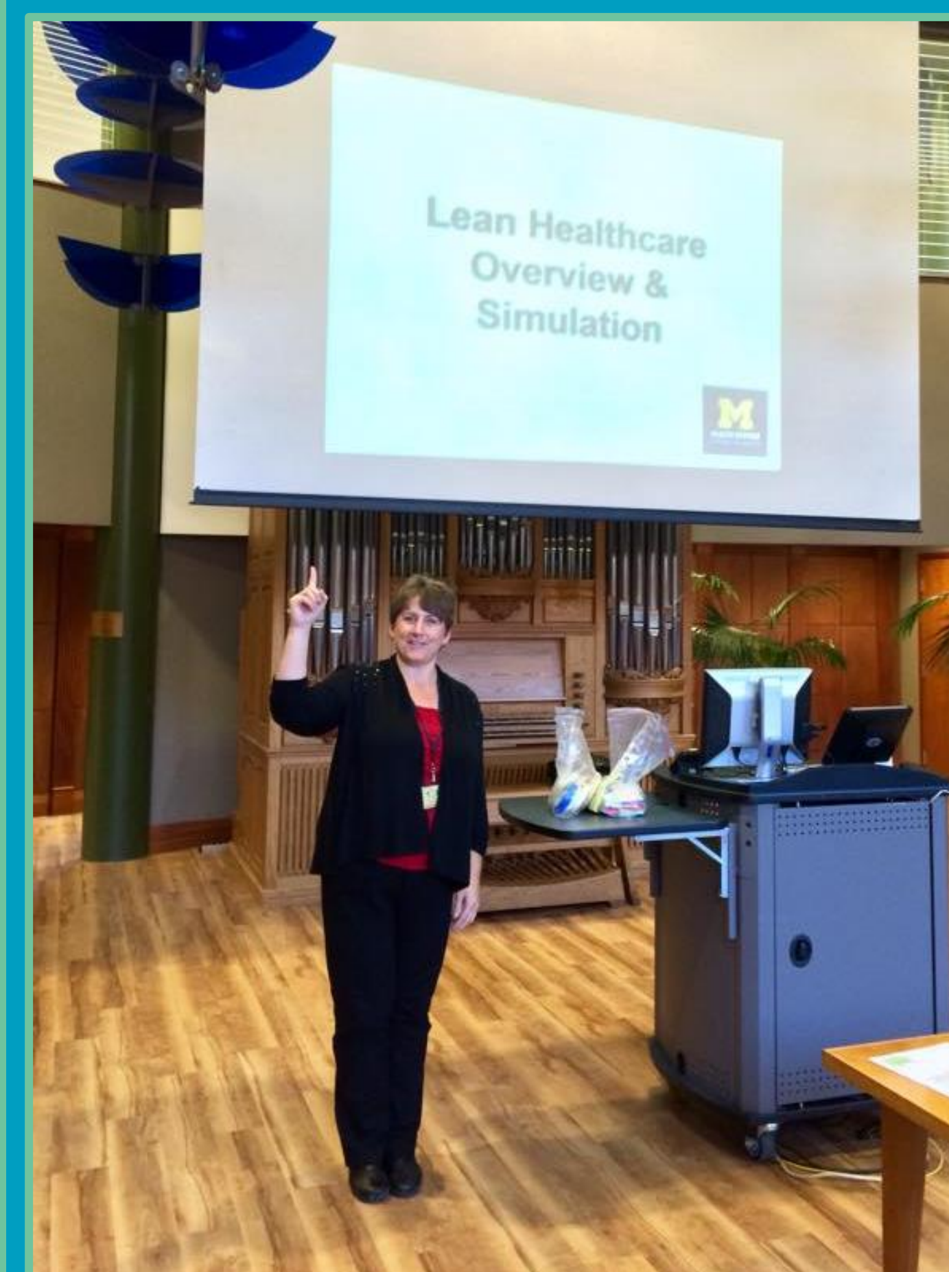
An UMHS Lean Coach starts a patient flow simulation with a review of core concepts